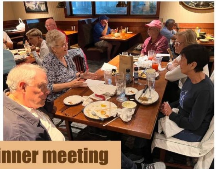
November dinner meeting