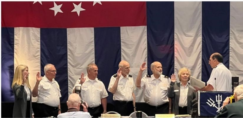
National Bridge. February 25, 2023