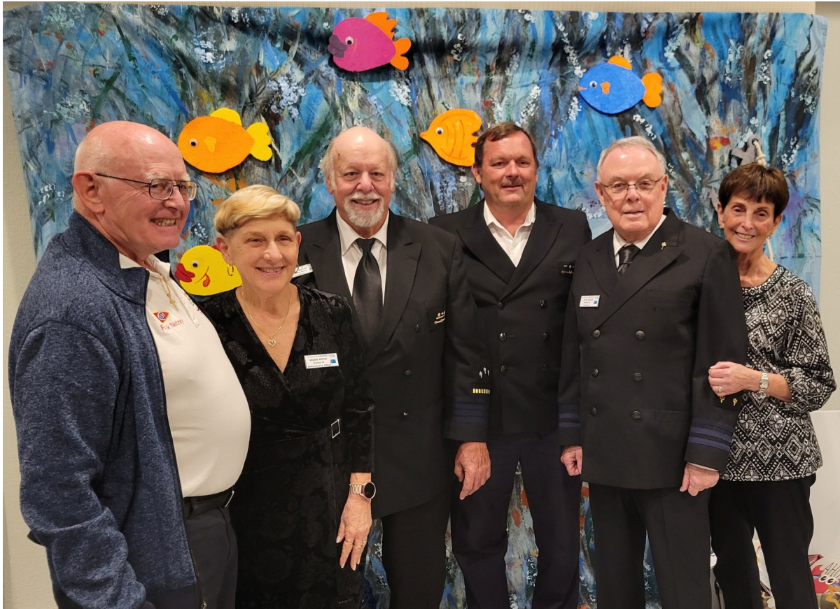
Representatives of Daytona Squadron enjoy D23 Change of Watch