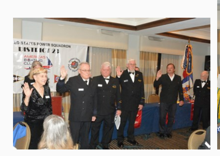
Swearing into office the D23 Bridge