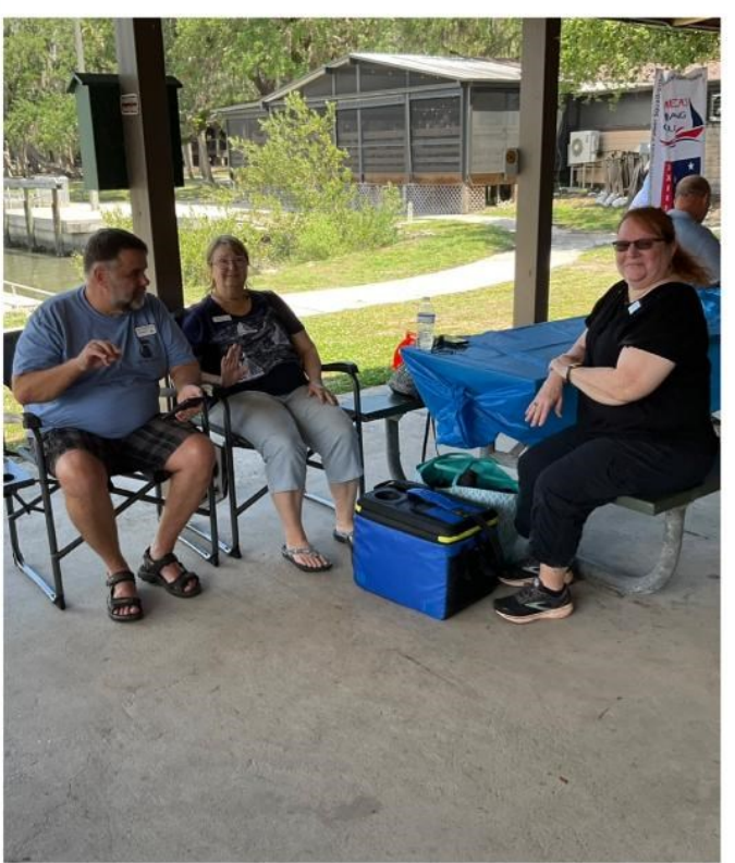
at Bings Landing Captain D'S BBQ