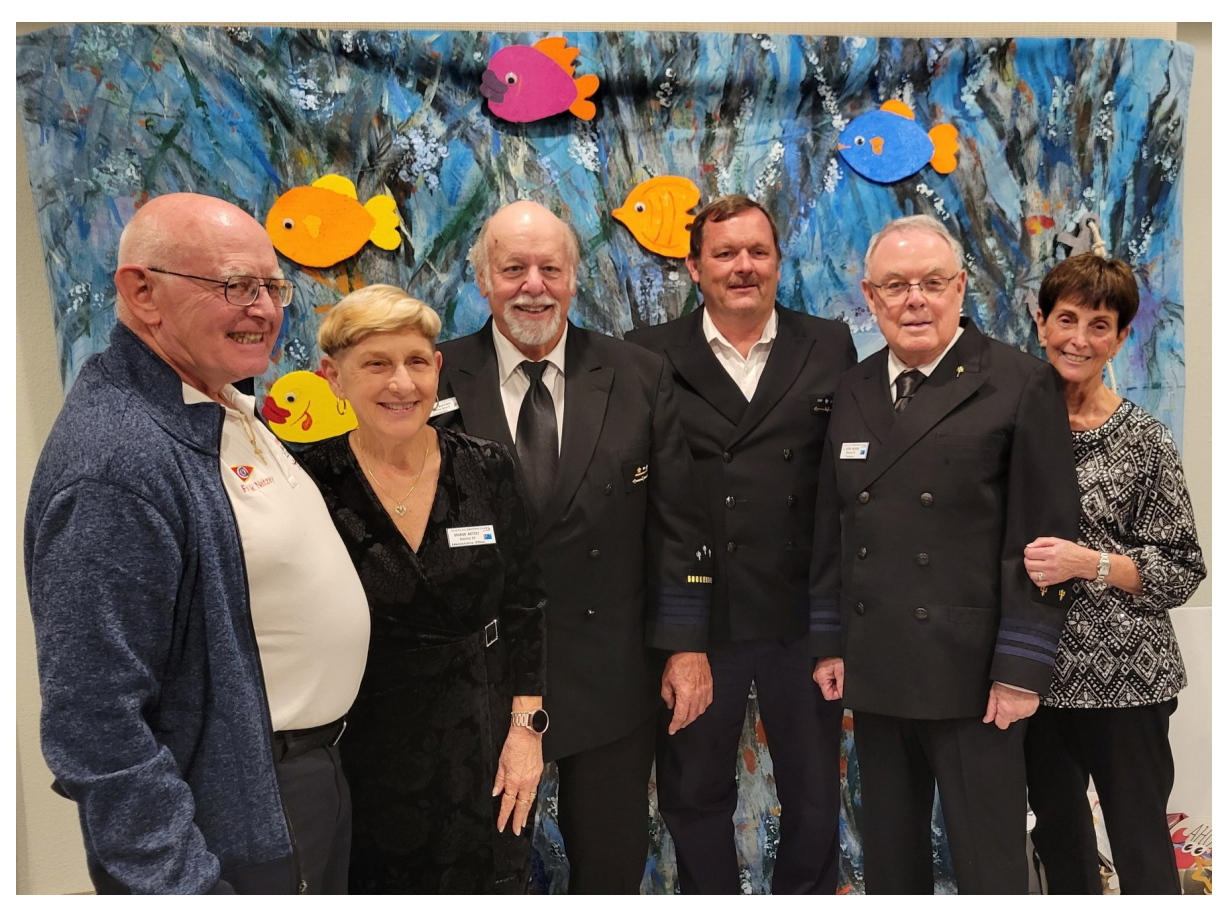
Representatives of Daytona Squadron enjoy D23 Change of Watch