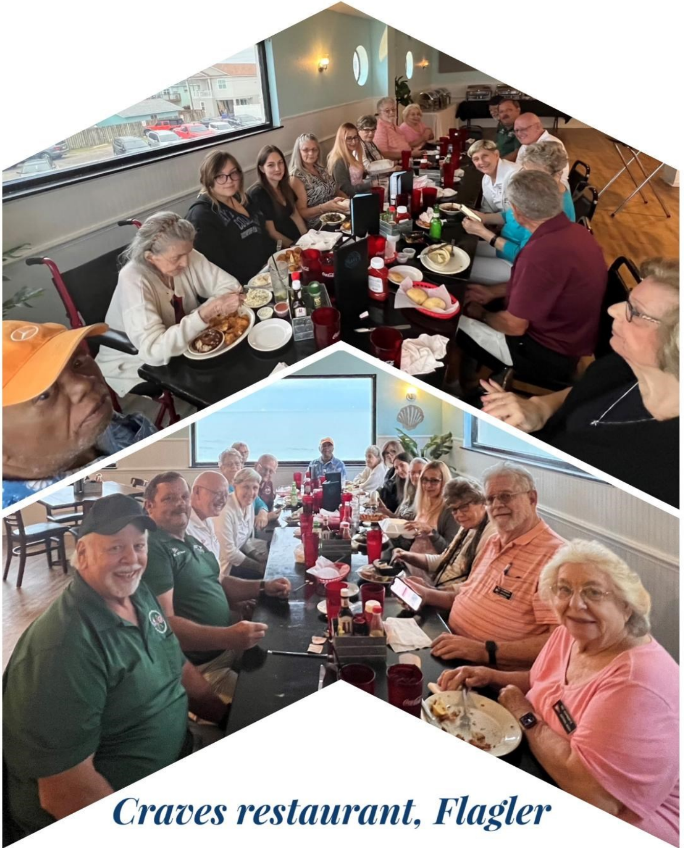
Craves restaurant, Flagler