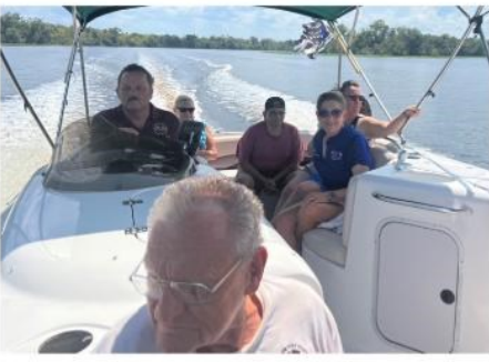
St John's river cruise